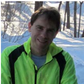
Where there's a need, There's a Lion!