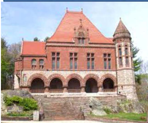
EASTON LIONS THRIFT STORE "OAK AMES BRANCH"