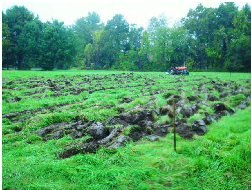
Putting Green, Hole 18