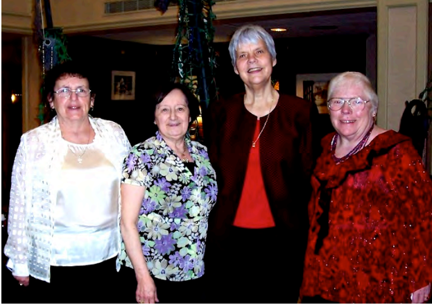
These sophisticated ladies ...