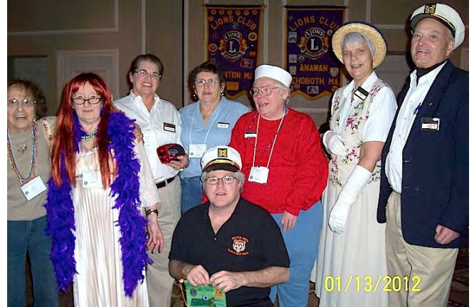
Starred in a remake of Gilligan's Island? (Featuring Lady Gaga? Bravo! Ruth!)